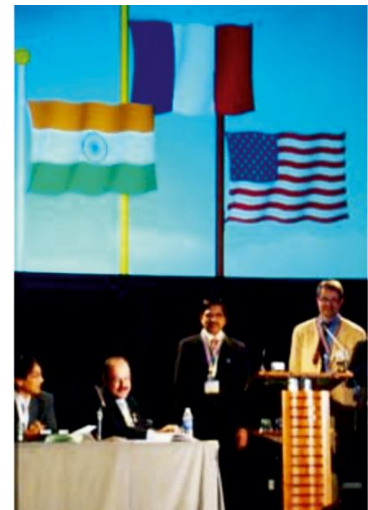
'Olympic Silver Medal Winner' 1 st International Olympic Surgery in Minimal Access Surgery Competition held at Phoenix, USA, April 2009