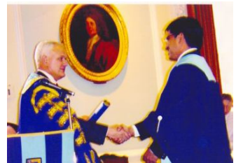
Honorary Fellowship - Royal College of Surgeons of Edinburgh, UK, 2004