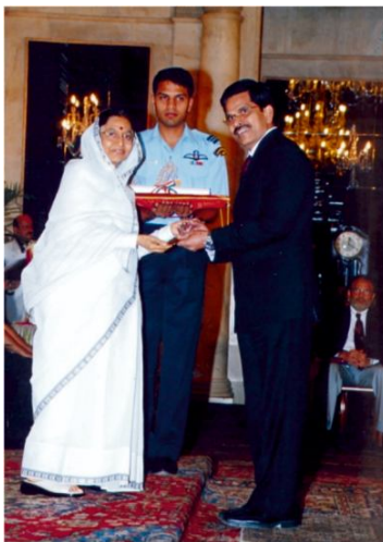
Receiving Dr. B. C. Roy National Award from the President of India, July 2008

Prestigious orator of platinum jubilee celebration of Association of Surgeons of India, Dec 2013, Ahmedabad. Theme of oration "My Country. My People. My Surgery", journey over 30 years in developing the cancer surgery in India. Then Chief Minister of Gujarat, Shri. Modi called him and appreciated his service in promoting high tech surgery affordable to common people irrespective their socioeconomic strata.