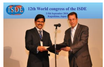
Best Tehnique Award, World congress of Esophagus, Japan, 2010