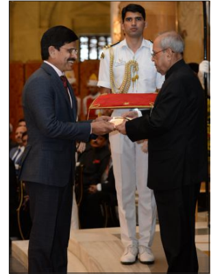
Receiving second time Dr.B.C. Roy National Award under "Eminent Medical Person" category